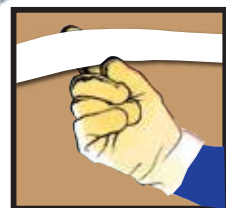
Move 1,000 pound loads with one finger.

Effortless Improved Roll Resistance of the Dual Skate Wheels